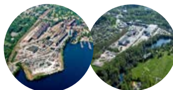
Smedjebacken & Boxholm Efficient billet casting process with different rolling mills able to customize steel products