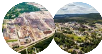
Hofors & Hällefors Ingot based casting of highest quality clean steel

Leverage our deep experience in industry-leading engineering steels, extensive knowledge of customer applications and well-trained local sales and service staff backed by a global R&D network.