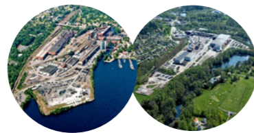
Smedjebacken & Boxholm Efficient billet casting process with different rolling mills able to customize steel products