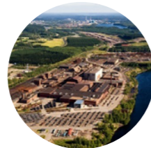
Imatra Heavy bloom casting with focus on machinability