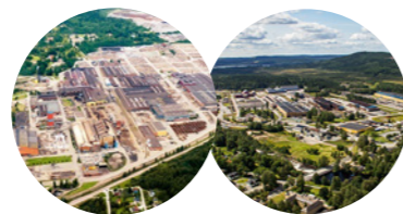
Hofors & Hällefors Ingot based casting of highest quality clean steel

Leverage our deep experience in industry-leading engineering steels, extensive knowledge of customer applications and well-trained local sales and service staff backed by a global R&D network.